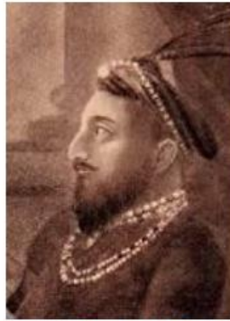
Nawab Murshid Quli Khan