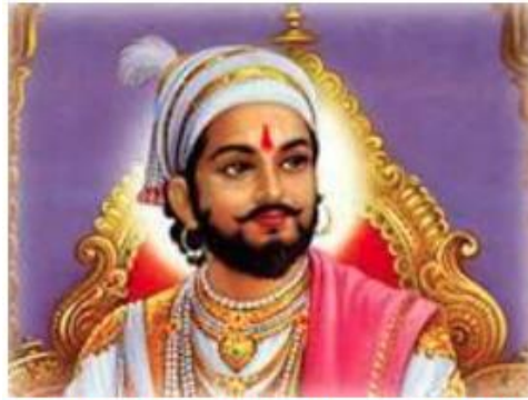
The Marathas became a powerful force under Shivaji