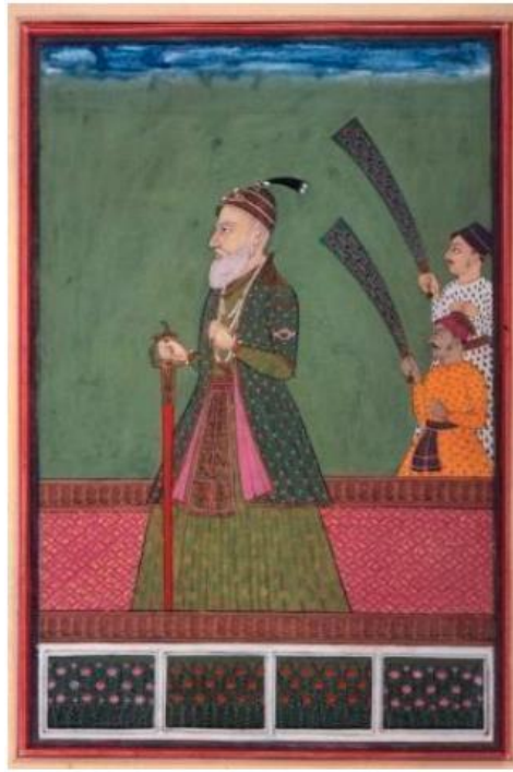
Nizam-ul-Mulk Asaf Jha