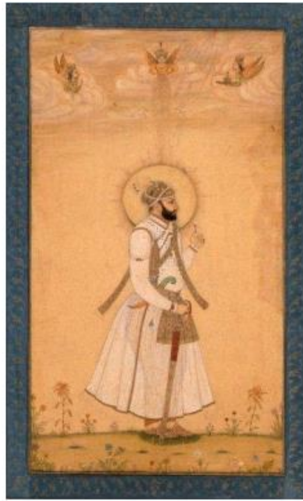
Mughal Emperor Farrukh Siyar