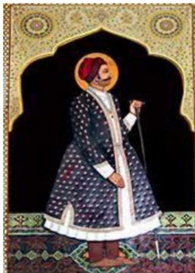
Siwai Raja Jai Singh II