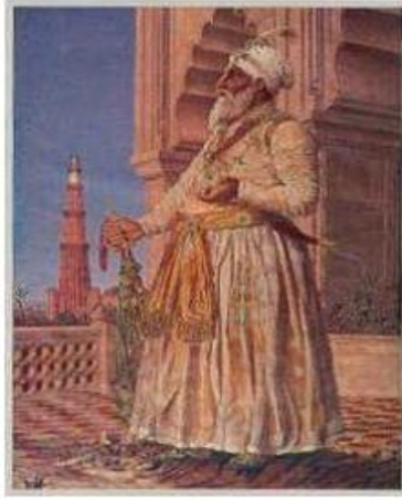
Burhan-ul-mulk Saadat Khan